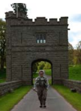
The tower on the bridge at Penmyarth.

IF YOU WERE to sit someone down and explain why you love to go fishing, what would you say? For me it is mainly about good company in beautiful surroundings. Although catching fish is secondary it is still important, so when everything comes together you will experience days whose memory will stay with you for the rest of your life.