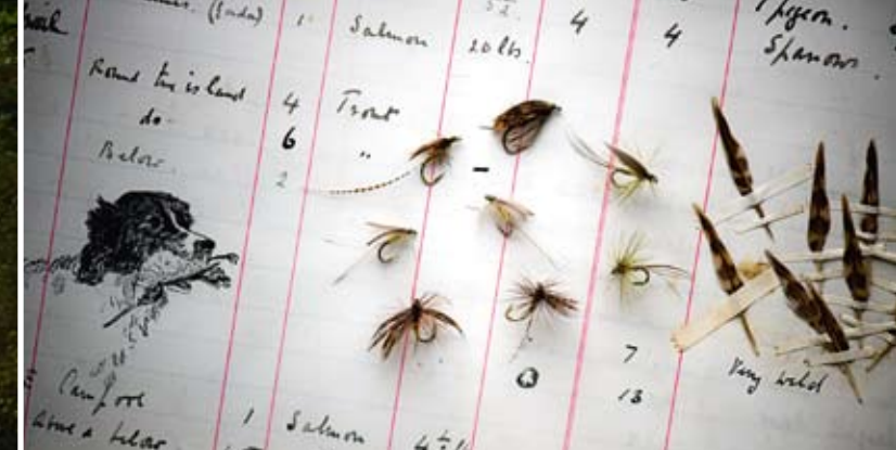
Harry ready with the net. Above: salmon and trout feature in the game book.

The river is fly-only for trout and the season runs from March 3 to September 30. Fishing is fly only for salmon until June 1, with fly and spinning allowed thereafter until October 17. The main fishing is for trout, however, and it would be interesting to see how the river would respond to some