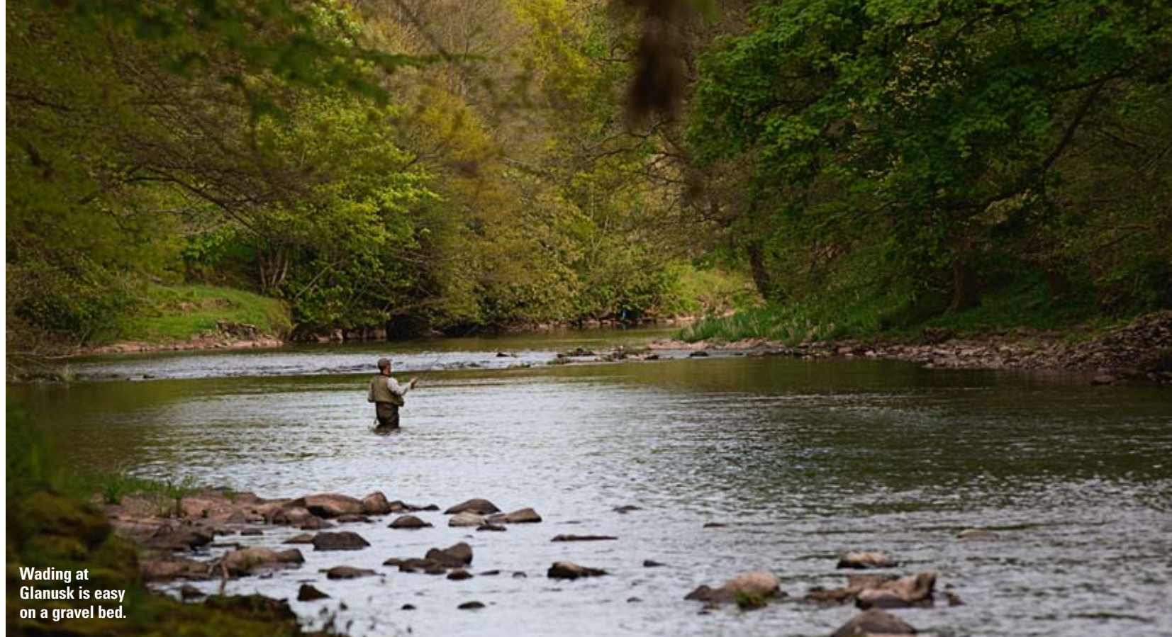
Wading at Glanusk is easy on a gravel bed.

“We started on the upper beat, working upstream through Quarry, Hornet Oak, Church Falls to the Garden pool”