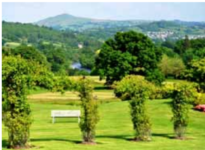
View from Penmyarth Lawn

The Rod Room is adjacent to the main house and is an atmospheric location for lunches or warm cups of tea!! The Rod Room is a real treat.