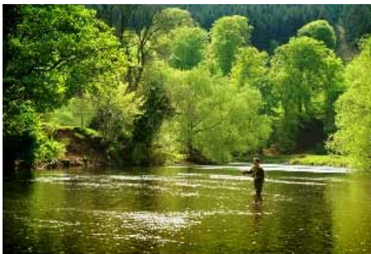
One of the beats