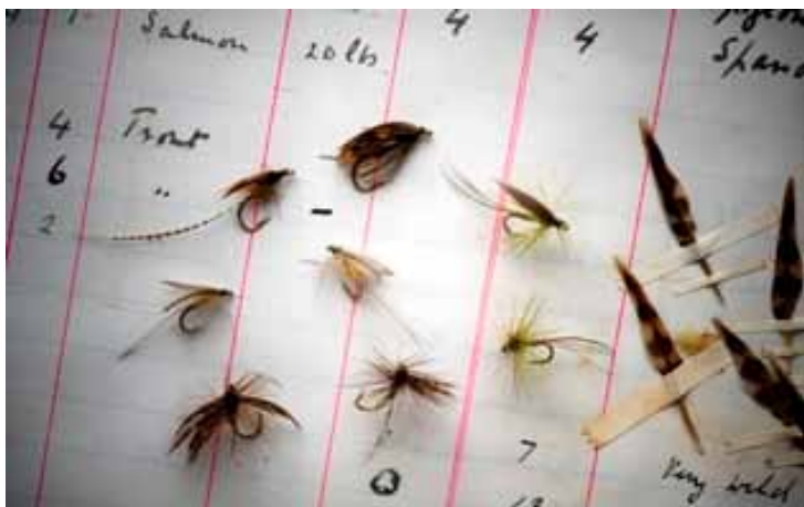
A selection of hand tied flies, available during your stay along with full kit if required