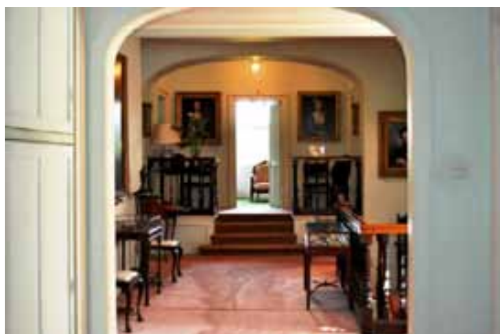
First Floor at Penmyarth House

The tower overlooking the five mile private stretch of the River Usk, a listed building positioned on Tower Bridge is a quite spectacular fishing hut!!