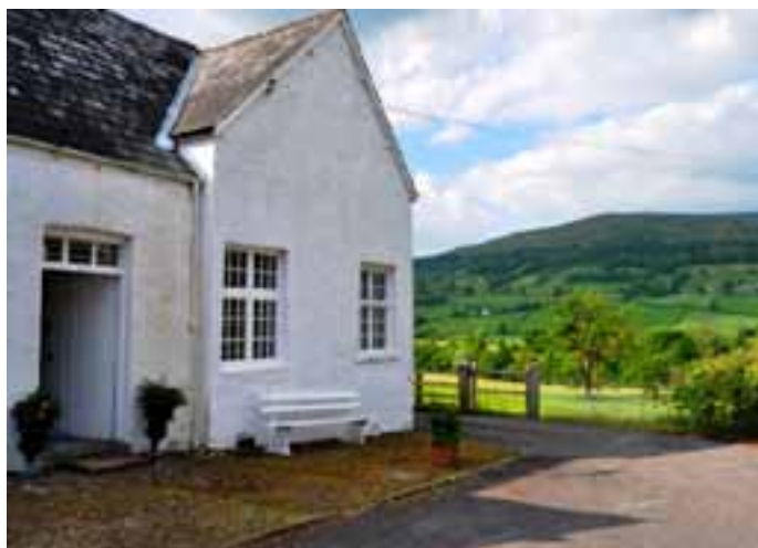
The Rod Room