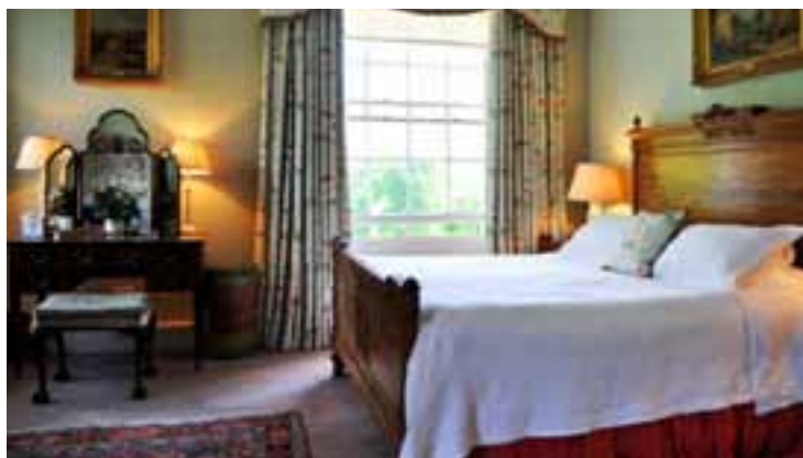
Double Room with Park Views and Ensuite

Penmyarth House comes fully staffed and every need can be taken care of by the team.