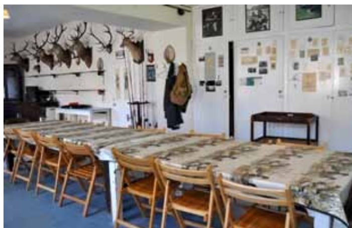
Inside the Rod Room where you will meet your ghillie