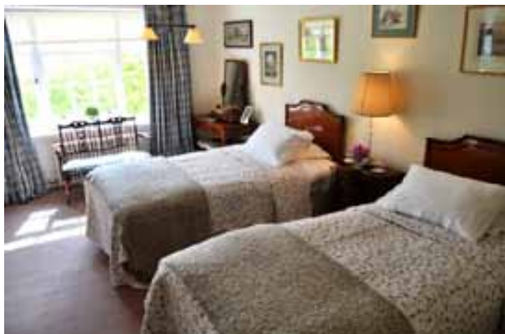
Twin Bedroom with Private Bathroom

Locally produced and delicious food is provided, a sample menu for full catering is provided for your pleasure.