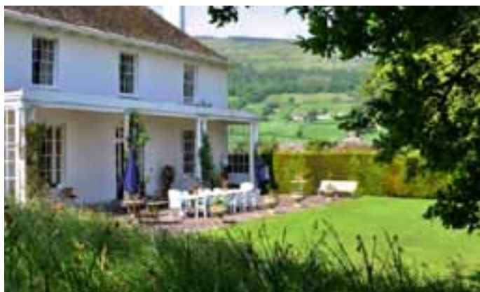
Sit outside on the veranda and enjoy the stunning views

The dining room can seat up to twenty four people and there are a number of other outstanding and alternative venues for entertaining within the park walls should you wish for a change of scene.