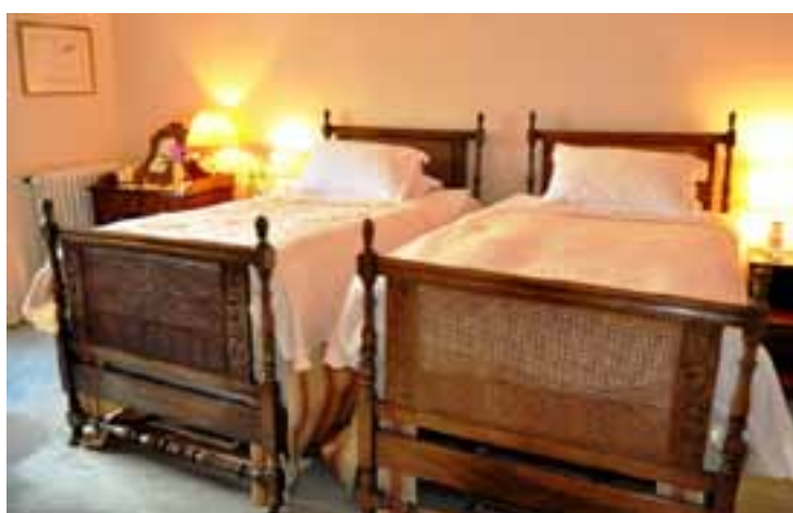
Twin Bedroom with Private Bathroom

Penmyarth Church was also built in 1836 and the bridge was rebuilt in 1846.