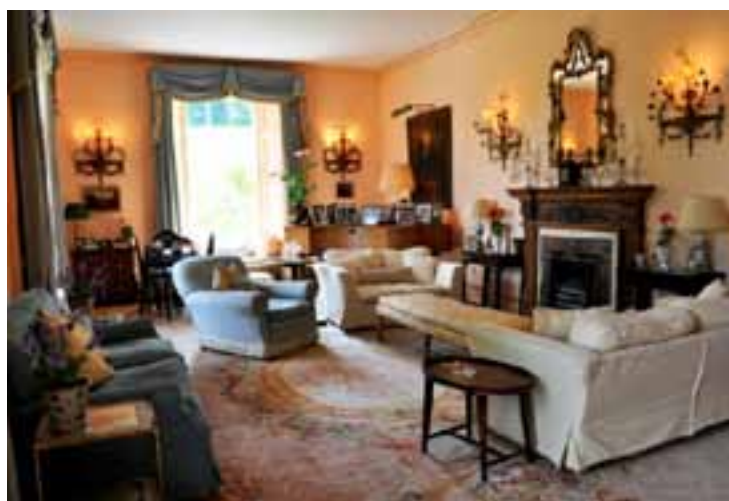
The Drawing Room