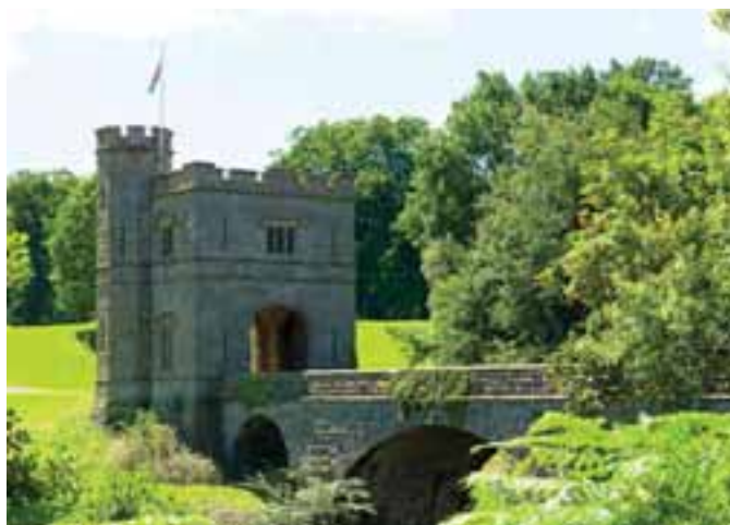
The Grade II Listed Tower Bridge

Availability is weekends or weekdays. Minimum five in party.